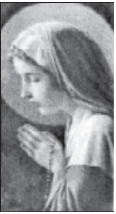
Blessed Mary, Ever-virgin Mother Of God

5. Ask that your parish have the following announcement put in the parish bulletin one or more times: TWO MILLION ROSARIES TO END ABORTION is scheduled to take place on May 11th, 2002 (Saturday) during the 8:00 a.m. hour. This is a prayer event for an end to the surgical and non-surgical killing of unborn babies. For more information: Rosaries for Life; P.O. Box 41831; Memphis, Tennessee 38174; U.S.A. For more information, the registration page, etc.: www.ROSARIESforLIFE.org