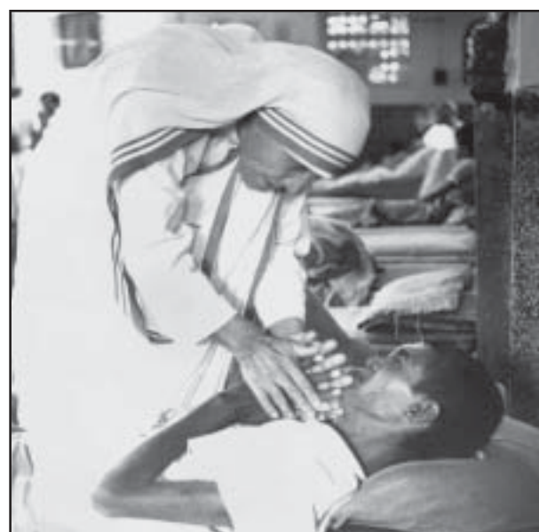
Mother Teresa holds the hand of an ailing man at the Missionaries of Charity home in Calcutta in this undated file photo. The postulator in her cause for sainthood said he is struck by all Mother Teresa had accomplished, even during times she felt God might have abandoned her.