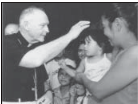
Cardinal Theodore McCarrick of Washington blesses a child as he greets residents of Izalco, El Salvador, a town devastated by last year's earthquakes.

tion on March 10, 2002. This annual appeal, which helps to build the international social ministry of the Church, funds the work of four agencies: