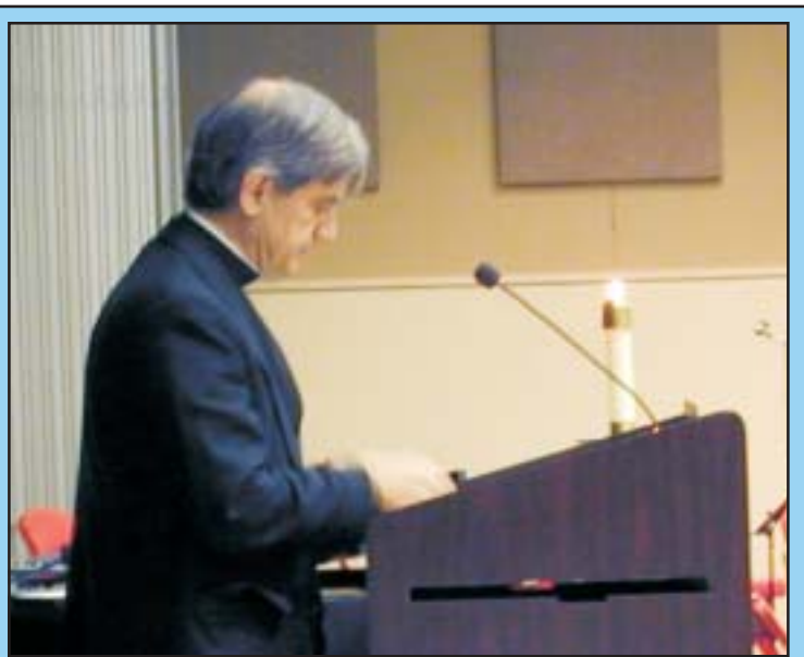
Reverend Richard Fragomeni addresses over 400 participants at the annual Diocesan Conference Day for the Diocese of San Angelo on February 23, 2002.

"Abstinence is the surest way and the only completely effective way to prevent unwanted pregnancies and sexually transmitted diseases. When our children face a choice between self-restraint and self-destruction, government should not be neutral. Government should not sell children short by assuming they are incapable of acting responsibly. We