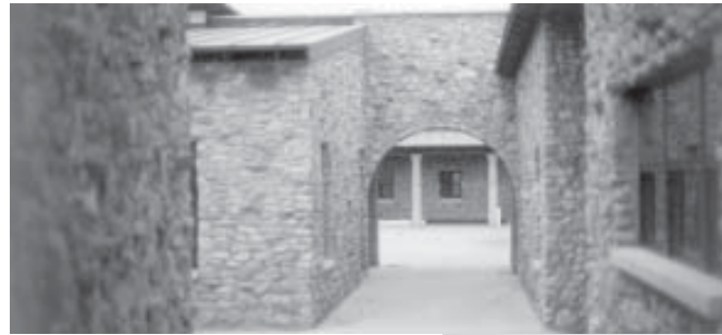
Walkway Near Courtyard

Construction will be completed while the Sisters are there, with the intention of having a Dedication Service sometime in the fall. There will be an opportunity at that time to walk through the completed Monastery and to participate in the ceremonies of blessing the religious house.