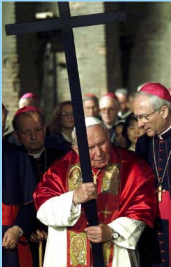
Pope John Paul II leads the Way of the Cross around Rome's ancient Colosseum on Good Friday, April 21.