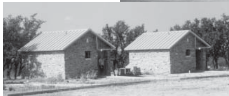
Sisters' Individual Cells

The Carmelites extend their gratitude to us all and entrust us into the Hearts of Jesus and Mary that we may receive all the tender love God has for us. "He never tires of giving; may we never tire of receiving" (St. Teresa of Avila).