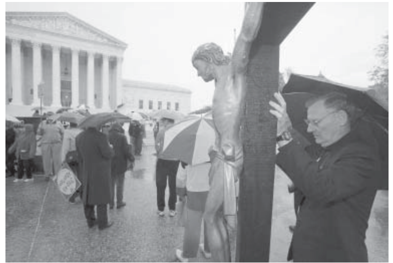
Priest Prays While Supreme Court Hears Arguments

Founded in 1981, Human Life International ( http://www.hli.org ), 1-800-549-LIFE is the world's largest pro-life, pro-faith, pro-family educational apostolate, with chapters in the United States and a network of international branches and affiliates serving 90 countries.