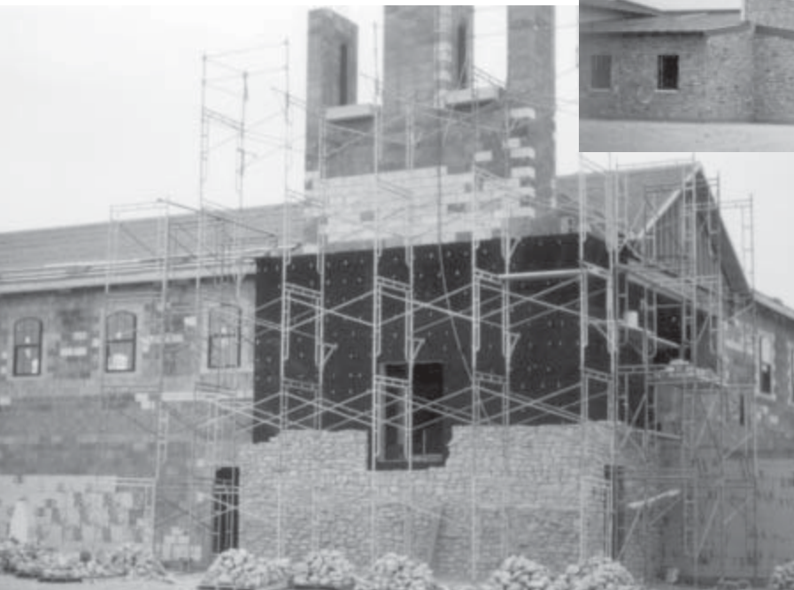
Carmel Monastery of Our Lady of Grace (Under Construction)

ranch house on the Eastern outskirts of San Angelo was dedicated as the home for six Carmelite Sisters. Tears of joy from the Angels in Heaven poured down upon the assembled in the form of a pouring rain. The power of prayer and love was experienced by the assembled that evening, foreshadowing the many graces that would rain upon the Diocese through the presence of the Carmelite Monastery. "Prayer is an art of love, it is the means which