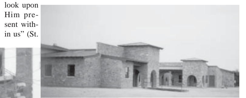
View of Back

the desert, there I shall speak to her heart" (Hosea). Yes, they will make haste into the Hill country on May 31st, the Feast of the Visitation of Mary to Elizabeth. As Mary's visit to Elizabeth was the beginning of something great, so too this move is the beginning of something great, not only for the Carmelite Sisters, but for all the faithful. "The more ardently they unite themselves to