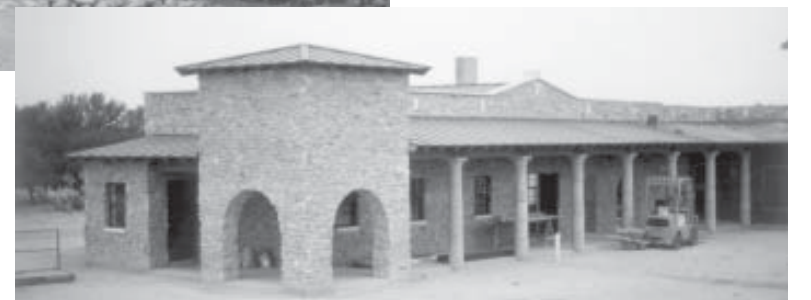
Courtyard View.

Christ through a self-surrender involving their entire lives, the more