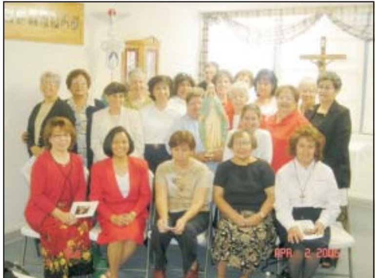
The Legion of Mary Acies of the Mary, Mother of Unity Curia of San Angelo.

light pollution have all begun to destroy our Earth little by little. We need to redeem ourselves with God by finding ways to resolve the problem. Car-pooling, recycling, picking up trash, and conserving electricity are a few ways we can save our environment. We should all cherish the time we have on this great planet, and we should all start now.