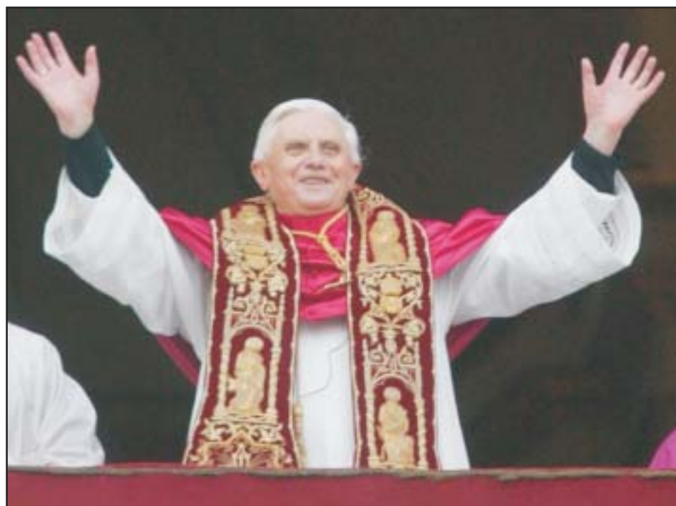
NEWLY ELECTED POPE BENEDICT XVI SMILES. Pope Benedict XVI became the 265th pope April 19 on the second day of secret elections by the world’s cardinals.