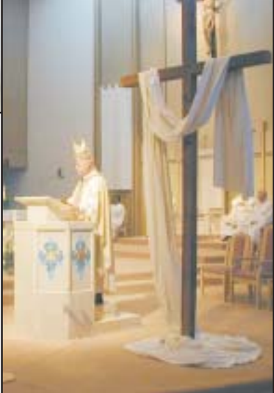
(Right) On April 20, Bishop Pfeifer presided at Mass at the Cathedral Church of the Sacred Heart in celebration of the election of Pope Benedict XVI.