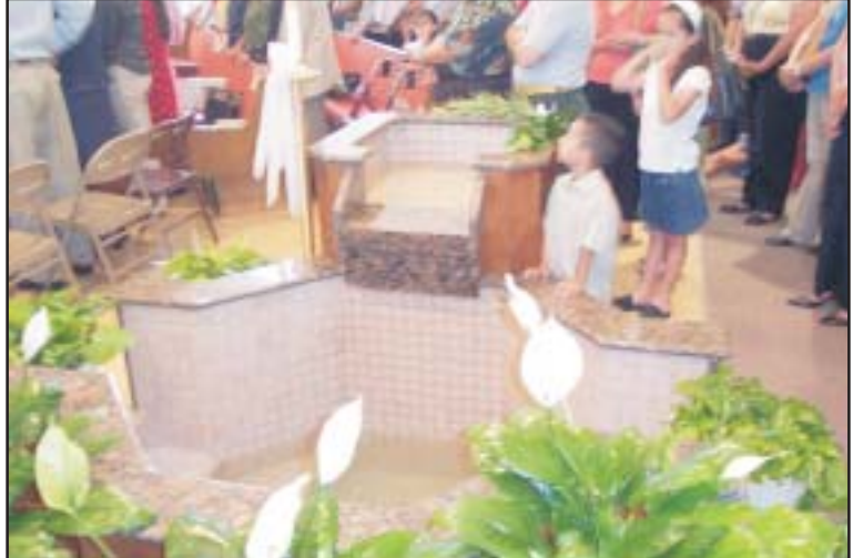
Young parishioners look at the new Baptismal Font during the celebration. They may have been considering a quick dip as the air conditioning was laboring with an overflow crowd.

down and to see the old building torn into. However, the plan was not to change the spirit of the parish or the traditions that are dearly loved, but to add to and build on for the future. Much of the "new" church was recycled from the old. For example, the new stained glass windows were made from pieces of the old. The Mosaic of Our Lady of Guadalupe, long a fixture in the church, was refurbished and is central in the Reservation Chapel. The doors from the original church built in 1930 have been restored and are displayed in the new building.