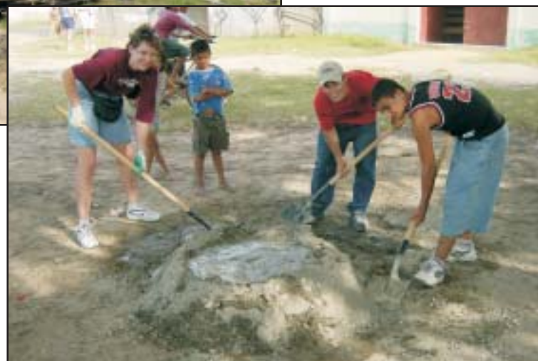
Right: Concrete is mixed in an open pit; no need for fancy equipment, and cost effective.