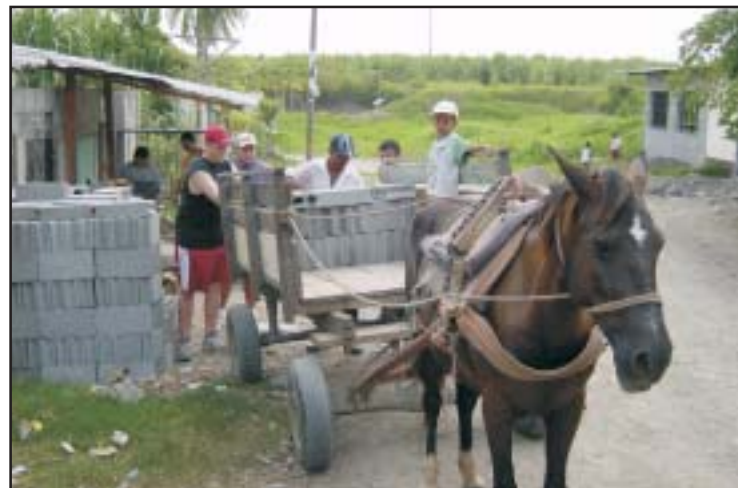
The group loads recently made bricks to bring to a building site.

and Holy Family Mission in Mereta became very interested and asked their pastor if they could make a mission trip to Honduras.