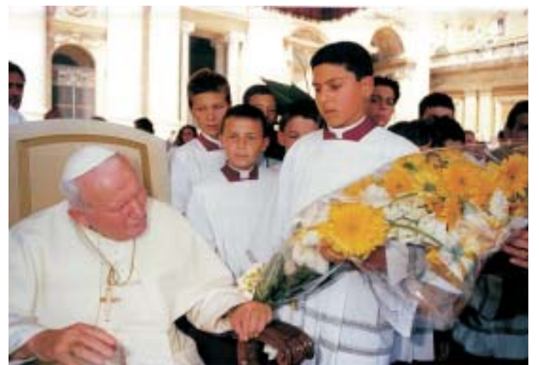
Altar servers present flowers to Pope John Paul II in St. Peter's Square Aug. 1. The pope's 1,000th general audience was attended by 22,000 altar servers.

Jesus. How happy I would be if from this friendship something more blossomed," he told boys in the group. "How beautiful it would be if some of you discovered a vocation to the priesthood."