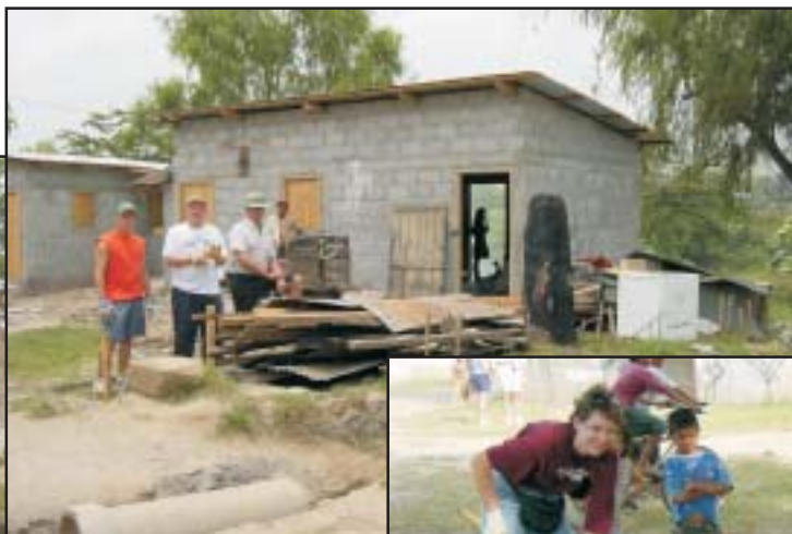
Left: Cleaning up forms around the building site.