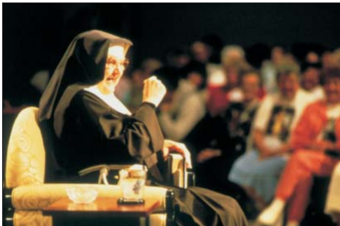
Mother Angelica on the set of “Mother Angelica Live,” her twice-a-week television program taped in front of a live audience at EWTN’s studio in Irondale, Alabama.

As EWTN enters its next 20 years, existing on support from thankful viewers and listeners, the network is concentrating on exploring the cultural and spiritual heritage of the Catholic Church, an approach attracting audiences of all faiths. Mother Angelica, without budgeting for the future, says she believes in going “where God opens the door.” Her strategy seems to be working.