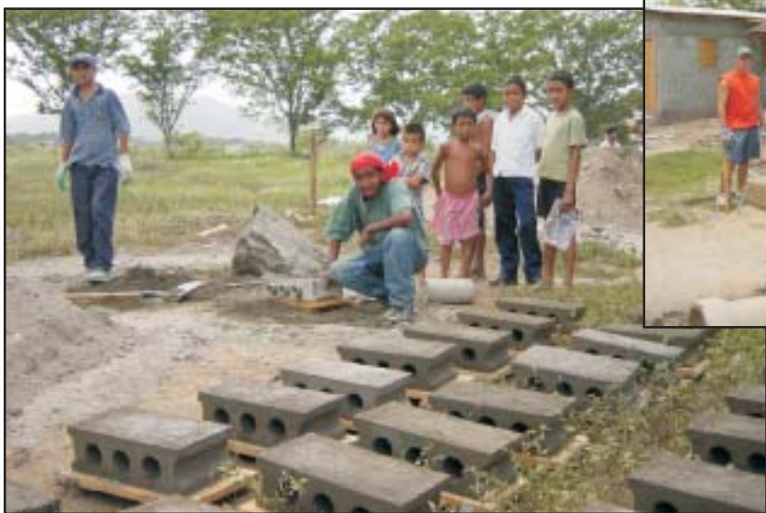
On site "Brick Factory."