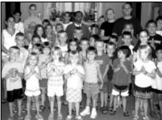
Rowena Vacation Bible School

St. Thomas Church in Miles hosted the annual Tri-Church Vacation Bible School from July 18-22. The Tri-Church VBS has been held yearly since the early '80's. The three churches that work together are Trinity Lutheran, United Methodist and St. Thomas Catholic, all in Miles. Each church takes turns hosting the VBS, but all three faiths work well together to offer music, skits, crafts and bible stories. This year 90 children from 3 years-5th grade attended. Over 60 adults volunteered. There was a display of crafts made by the kids along with songs and coordinating hand motions which the children learned during the week.