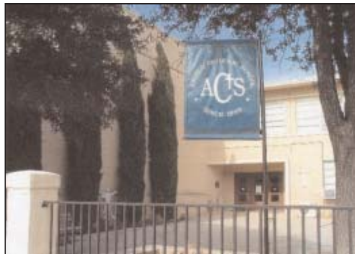
Angelo Catholic School, San Angelo