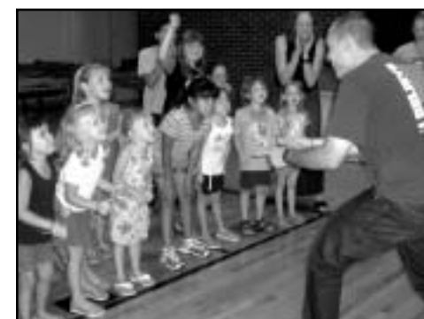
Rowena Vacation Bible School

St. Mary's in Brownwood held Vacation Bible School June 6-10 with great success. The curriculum chosen was KINGDOM OF THE SON. St. Mary's had over 100 children and 25 volunteers who participated in the week-long event. Much support was given by parishioners who donated supplies and snacks for the kids. Many junior high and high school youth volunteered as leaders and were looked up to by the young age children. This was the first time in at least 5 years that St. Mary's has had VBS.