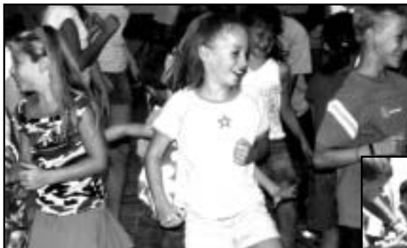
Kids dance to the morning gathering activity at Rowena's Totus Tuus program.