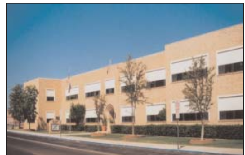
St. Ann's School in Midland.

"Spiritually and religiously we're very strong. As far as our programs, they are excellent. The formation and the discipline we provide goes to the total formation of the students."