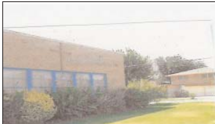
St. Mary's Central Catholic, Odessa