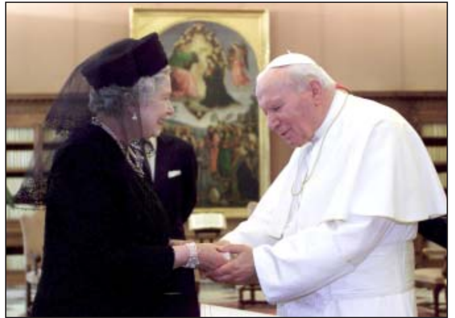
Britain's Queen Elizabeth greets Pope John Paul II at the Vatican Oct. 17. In their meeting the pope and queen expressed hopes for Christian unity and the alleviation of poverty.

wool suit with a black pillbox hat and short black veil to her meeting with the pope.