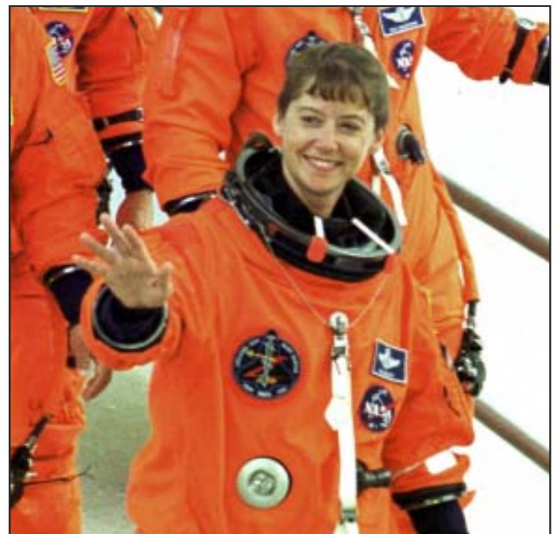
Rookie shuttle pilot Pamela Melroy waves to spectators before boarding the Space Shuttle Discovery in Cape Canaveral, Fla., Oct. 10. The shuttle launch was aborted that day due to weather, but the crew made a successful launch Oct. 11.

In an interview with ABCNews.com, Melroy said it was