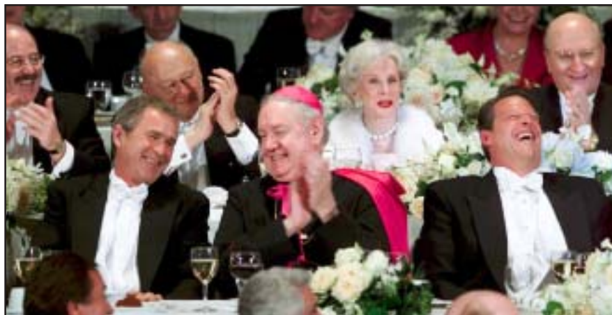
After a few hours of the printing of this edition one of these candidates will not be laughing this hard!

A margin of less than 2,000 votes separated Gore and Bush in Florida, where absentee ballots and a legally required recount dragged the result of one of the closest races in history into at least the next see "PRESIDENT" page eleven