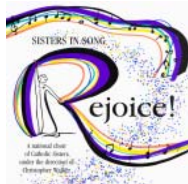
Cover To CD 'Rejoice' By Sisters In Song. Sisters in Song, a national choir of Catholic religious women, recently released their third collection of music. "Rejoice" includes a Celtic "Alleluia" and versions of the "Salve Regina" and "How Great Thou Art."