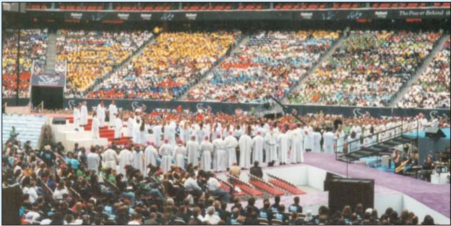
Opening Ceremony with 35 bishops in attendance.