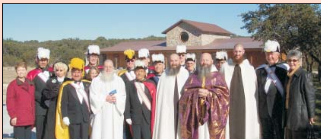
Knights of Columbus from San Angelo and their wives celebrated their annual 'Pilgrimage' to Mount Carmel Hermitage in Christoval, Texas on the First Sunday of Advent together with the Hermits of Mt. Carmel. The new entrance building of the Hermitage is shown in the background.