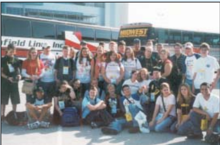
Holy Angels Youth Group.